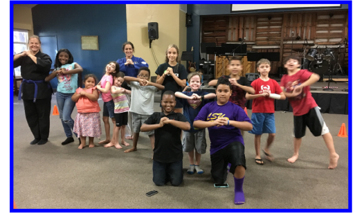
Kids in the TRANSFORMERS class!

One of our desires at OMMA is to always be a place where our MISSION, not MONEY is our focus. We love that there are families training with us that just couldn't afford to do martial arts anywhere else in our communities, but can with us. We love that we are able to provide scholarships for single moms, folks in full-time ministry, and others. OMMA is only able to do this because of the generous financial contributions from our partners in ministry, like you! Thank you!